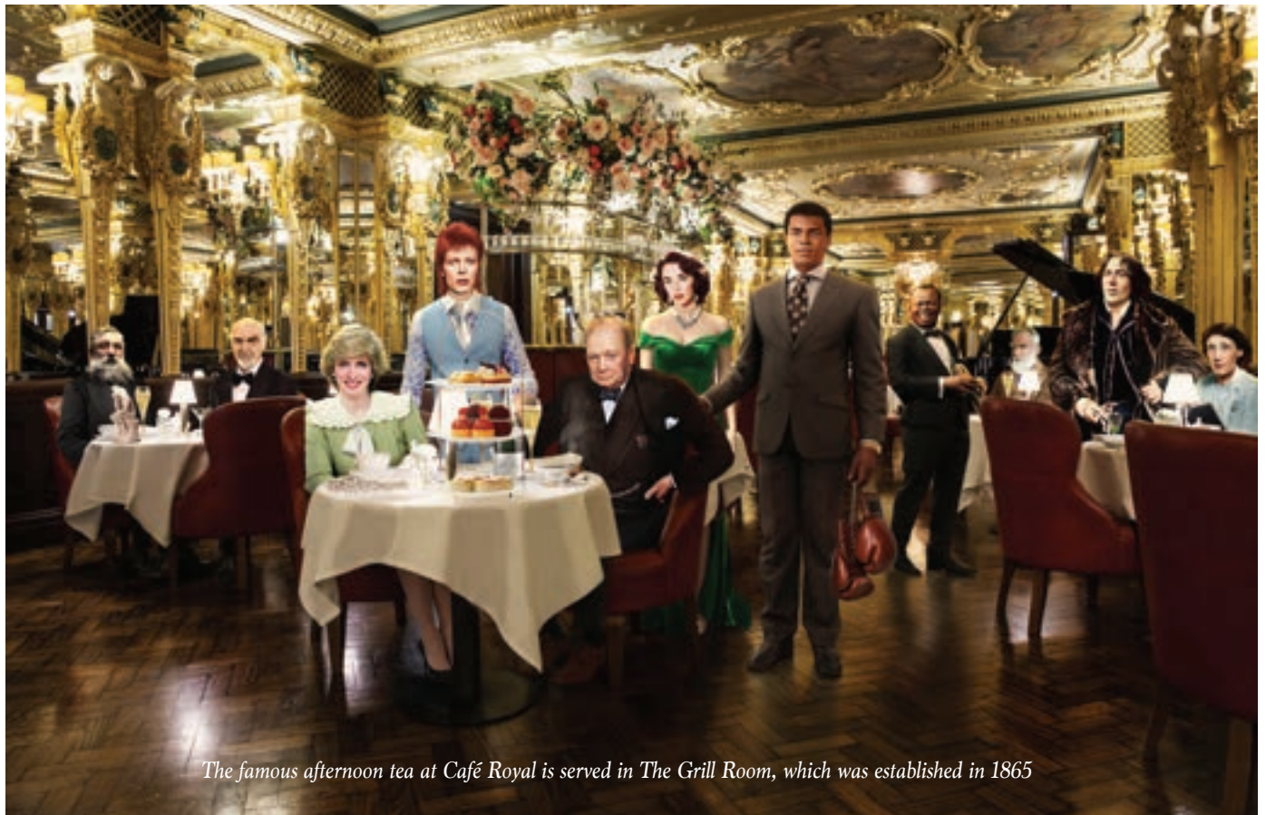
The famous afternoon tea at Café Royal is served in The Grill Room, which was established in 1865